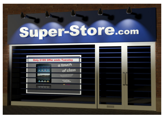
Laser technology projectors. Zero maintenance. 3yr warranty.

Using specially treated polycarbonate panels it is now possible to use the Media Shutter<sup>©</sup> to project both still images and full HD video from the inside out. Media Shutter<sup>©</sup> is a unique and